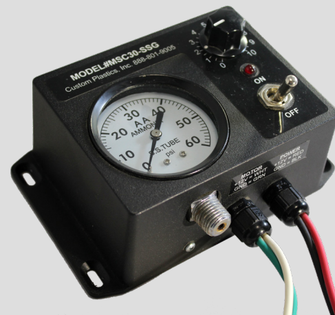
MSC30-SSG ANALOG PRESSURE GAUGE

No liquid in the cab. Easiest to read. Comes with 20' remote pressure transducer cable.