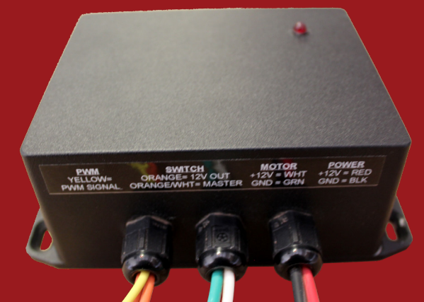
MSC-MOD PWM CONTROLLER FOR PRECISION FARMING SYSTEMS

Works with any PWM signal. Replaces the control valve. Faster adjustments than valves. Frees up a hydraulic circuit.