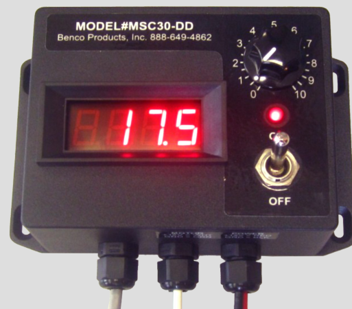
MSC30-DD DIGITAL PRESSURE DISPLAY

No liquid in the cab. Easiest to read. Comes with 20' remote pressure transducer cable.