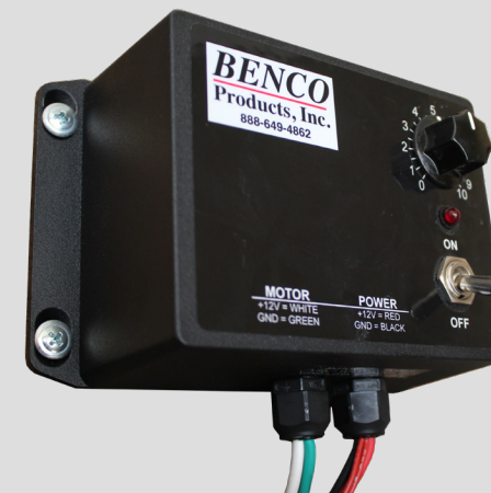
MSC30-NG NO PRESSURE GAUGE

Must plumb liquid into cab. Old school reliability. Completely analog solution. No digital parts.